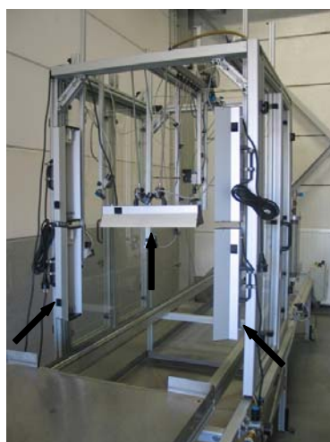
Figure 1: Representation of trial set-up with the motorised table. The black arrows indicate the position of the three different lights.

In the summer of 2009 two lab trials to test the efficacy of UV-c light against powdery mildew on apple seedlings and on strawberry was set up. In Figure 1, the assembly of the lights on a motorised table is shown.